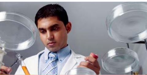
Business & Industry