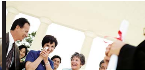
Students & Parents